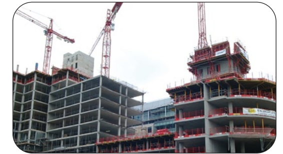
Allied Scaffolding Ltd, Oldham, Greater Manchester. Athena in use since 2002

Allied Scaffolding Ltd had a serious mission statement to get it right first time, every time. They needed a business management system that would grow with the business as well as saving them time, money and help with their environmental commitment. The answer to the challenge they set themselves has proved to be Athena.