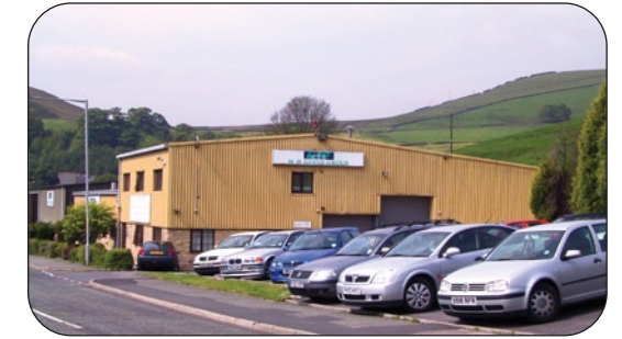
W H Good Automation Ltd, Haslingden, Lancashire. Athena in use since 2000

When W H Good Automation Ltd needed a sales management system fit for the 21st century, one that was easy to use, actively managed their sales team, and performed for everyone both inside and outside of the sales office, they chose Athena.